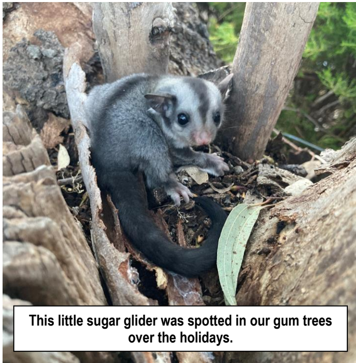
This little sugar glider was spotted in our gum trees over the holidays.

Science Works Excursion – Students are heading off to Science Works on Wednesday 11 th November for a fun day as they explore the interactive exhibitions and other experiences Science Works offer to extend curious minds of all ages.