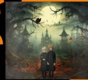
Photo opportunity: $2 per child or $5 per family. Images will be edited as below.

Entry: $5 per child or $10 max for a family (supervising adult/s free)