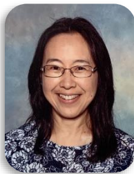
Ayako Mizushima Japanese